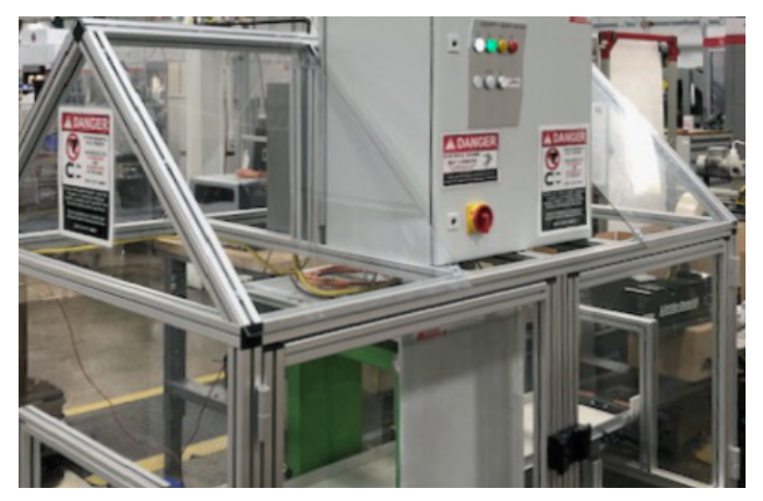
SE+DN in a fully automated production line