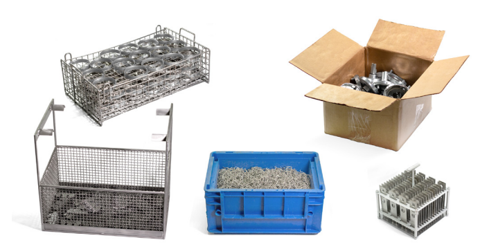
Especially suited for demagnetizing parts insidie of non-metallic (non-ferromagnetic) laundry baskets or containers