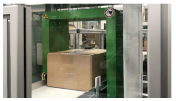
Active demagnetizing pulse for demagnetizing a box with bulk material