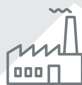
Machinery And Industry