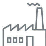
Machinery And Industry