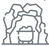
Stone, Sand And Mines