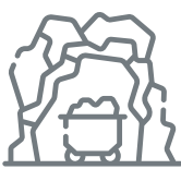
Stone, Sand And Mines